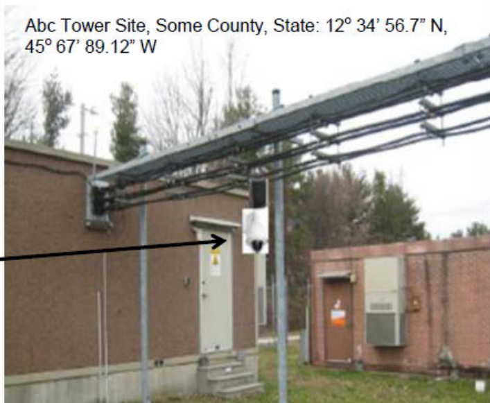
Figure 3. Ground-level photograph with graphic showing proposed equipment installation.

Ground-level photograph with excavation area close-up. The example in Figure 4 shows the proposed location for the concrete pad for a generator and the ground disturbance to connect the generator to the building's electrical service. This information can be illustrated with either an aerial or ground-level photograph, or both. This example has the name and physical address of the project site.