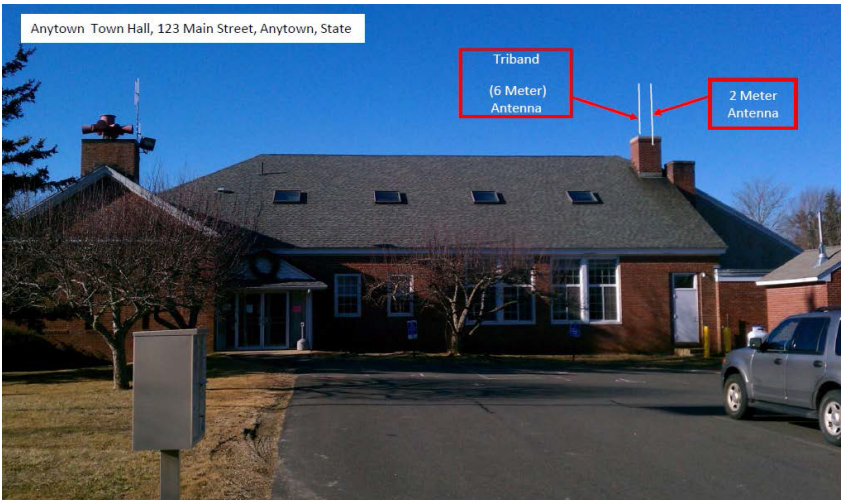
Figure 2. Example of ground-level photograph showing proposed attachment of new equipment.

Ground-level photographs. The ground-level photograph in Figure 2 supplements the aerial photograph in Figure 1, above. Combined, they provide a clear understanding of the scope of the project. This photograph has the name and address of the project site, and uses graphics to illustrate where equipment will be installed.