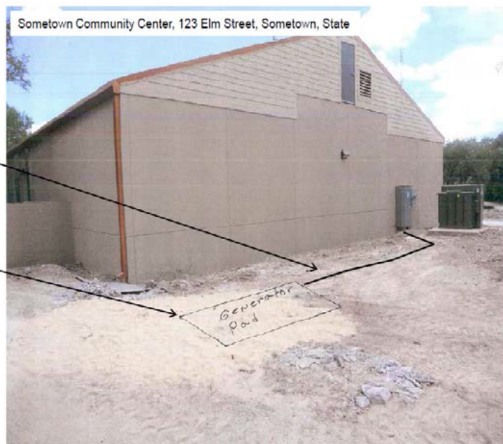
Figure 4. Ground-level photograph showing proposed ground disturbance area.